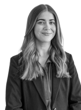
Grace Branch 03 6272 7444

Type : House Price : $ 470 per week Building Size : 99 sqm Land Size : 675 sqm View : https://www.4one4.com.au/property/29-calvert-crescent-herdsmans-cove-tas/8705319